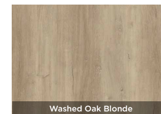
Washed Oak Blonde

NOTE: Due to printing and/or screen variations, colours in this brochure may differ from the actual products.