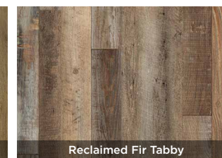
Reclaimed Fir Tabby