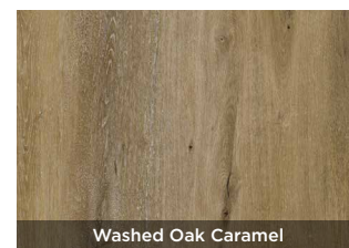
Washed Oak Caramel