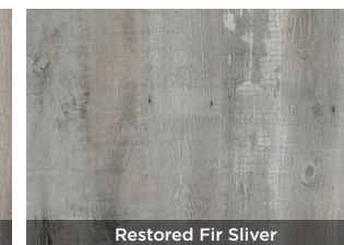
Restored Fir Sliver