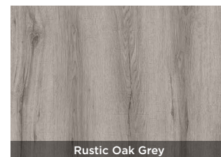
Rustic Oak Grey

TIER flooring is designed to be beautiful and functional. TIER is available in a wide range of natural colours and tones that embody the look of wooden flooring, without the maintenance hassle or environmental impact. Engineered to last and tastefully designed, TIER will enhance the look and functionality of your space. Choose from our range of colour options to make your floors a standout feature.